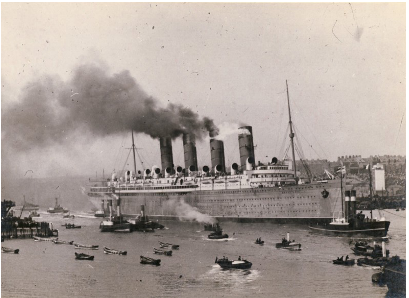
QSPS Mauretania at the mouth of the Tyne. TWAS:dx872/19

Carpathia is well known for being the only ship to rescue survivors following the sinking of Titanic. It took 700 people on board.